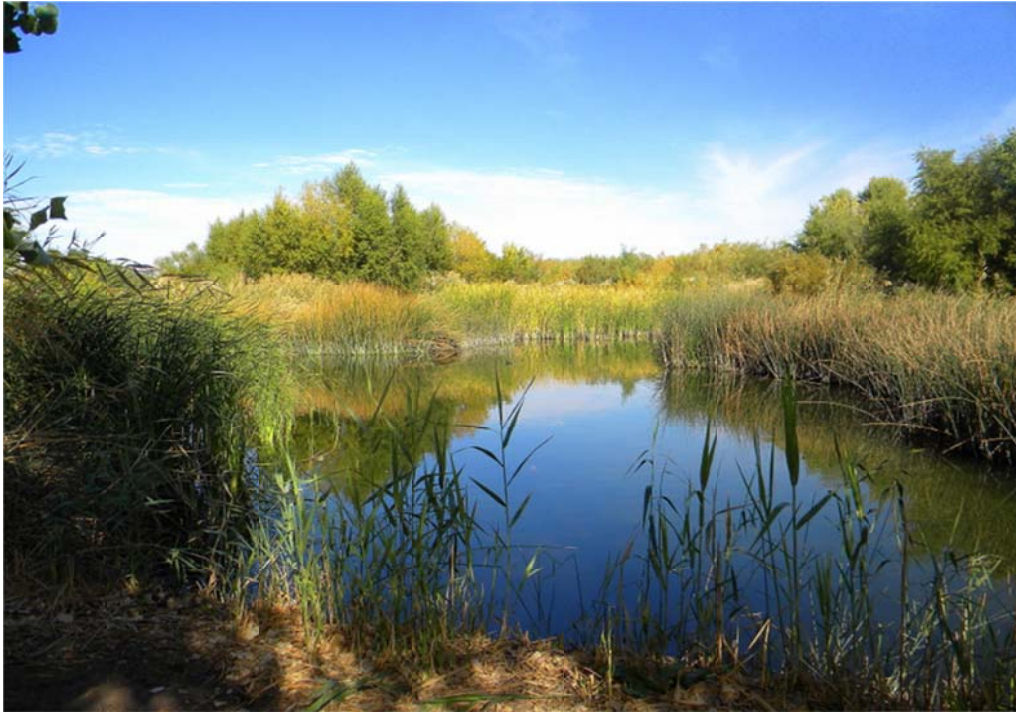
Nevada Desert Wetlands